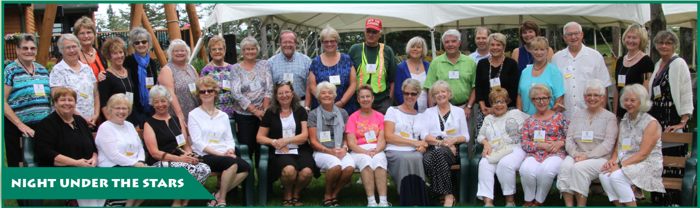
NIGHT UNDER THE STARS

NIGHT UNDER THE STARS • PANCAKE BREAKFAST • ICE TEE GOLF TOURNAMENT • QUILT AUCTION • JULY STORM DAMAGE