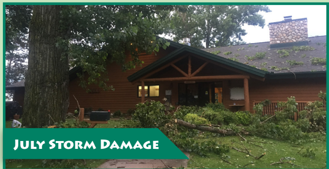
JULY STORM DAMAGE

Talented Volunteers - Both the North American Banking group and Zion volunteers share their time and talents to help prepare the camp for each summer camping season.