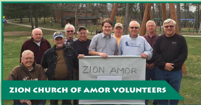
ZION CHURCH OF AMOR VOLUNTEERS

The 30th Annual Quilt Auction , sponsored by the Paul Bunyan Regional Auxiliary, raised over $60,000 for Camp Knutson. Beautiful quilts are contributed by churches, quilt groups, and individuals.