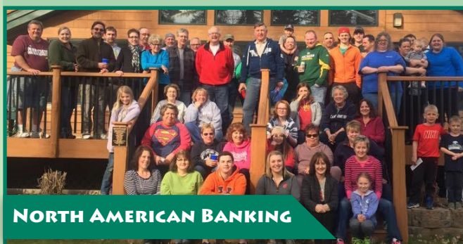
NORTH AMERICAN BANKING

A huge thanks to all who helped get camp back in shape after the July 21st storm where 80 + trees were lost. We are especially grateful for the efforts of the Crosslake Lutheran Men’s group, Mike’s Tree Service, and the North American Banking crew. Plans are already in the works to do replanting. If you are interested in helping us replant, please contact us!