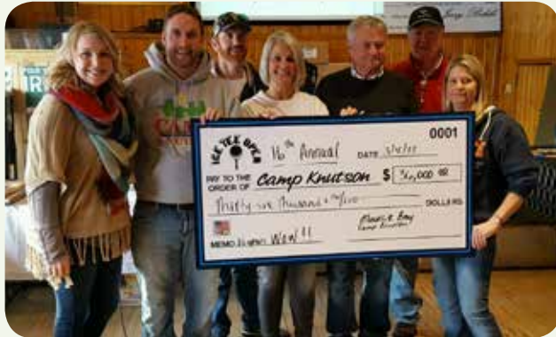
ICE TEE OPEN