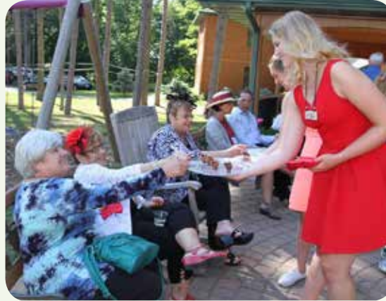
NIGHT UNDER THE STARS