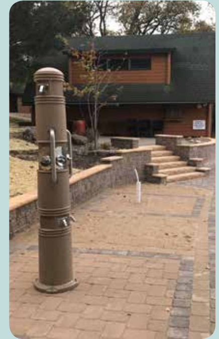
WATERFRONT PROJECT NEARING COMPLETION